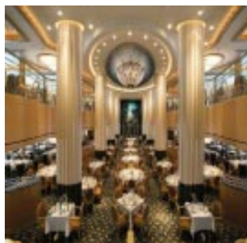
Fine or Casual Dining, your choice.