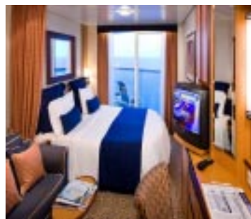
Choice of Beautiful Staterooms.