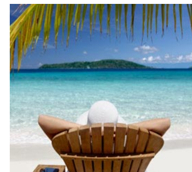
Enjoy a well deserved vacation with your friends.