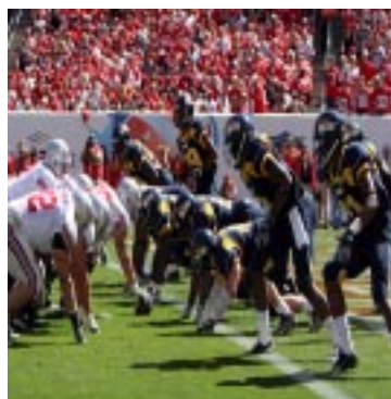
Support your ROCKETS and the important work at the UT Cancer Center.