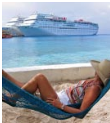
Enjoy fabulous weather and friends.